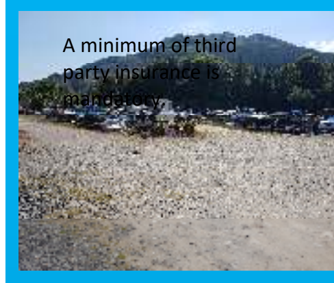
Area 1, Boat Park