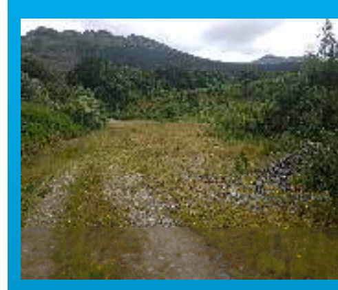
Area 2, Quarry (disused)