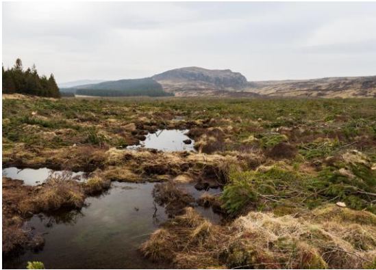
Figure 1b. Site response after almost three growing seasons on 07/09/2017