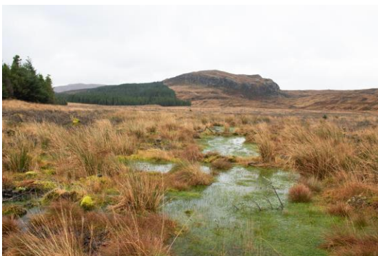
Figure 1c. Site response after seven growing seasons on 20/11/2021

Stump flipping and ground smoothing: this un-modifies the ploughed ridges and furrows which in most cases, if left in situ suppresses the water table and development of peatland vegetation, and promotes regeneration of negative indicators such as too much Calluna or non-peatland species or undesirable non-native and native trees. Care is needed when restoring sites planted with Lodgepole pine, as the root-ball penetrates into the peat much deeper than the flat root plate of Sitka spruce. When flipping LP stumps, it is undesirable to bring catotelmic (deeper) peat to the surface, so a 'light touch' ridge and furrow reprofiling should be carried out if possible, leaving stumps in situ, to smooth most of the surface. This is only possible where stumps were cut low using a shears head (because stumps of standard height will throw the tracks on the machine), or access routes will need to be carefully planned and stump flipped, to allow access to particular parts of the site.