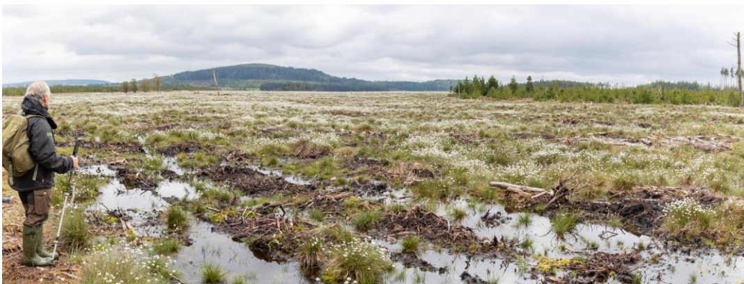
Figure 2. Gow moss after site has been treated using stump flipping and ground smoothing techniques.

Backfill trenches (trench linear bunding, but without a high bund): this counteracts excessive lateral flow of water within the peat, usually promoted by historic events or modifications, such as fire, peat bank cutting, or peat cracking. This can result from the ploughing and draining carried out during afforestation, and the subsequent drying and suppressing effect of the mature trees on the peat and water table.