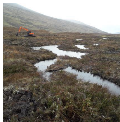
Figure 5b. Re-profiling of peat hags and the resulting higher water table.