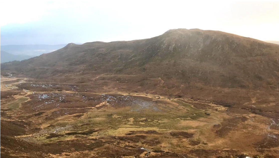
Figure 6. Landscape perspective of Beinn a Mheadhoin after restoration.

Deciding upon restoration methods (to be replaced by separate document)