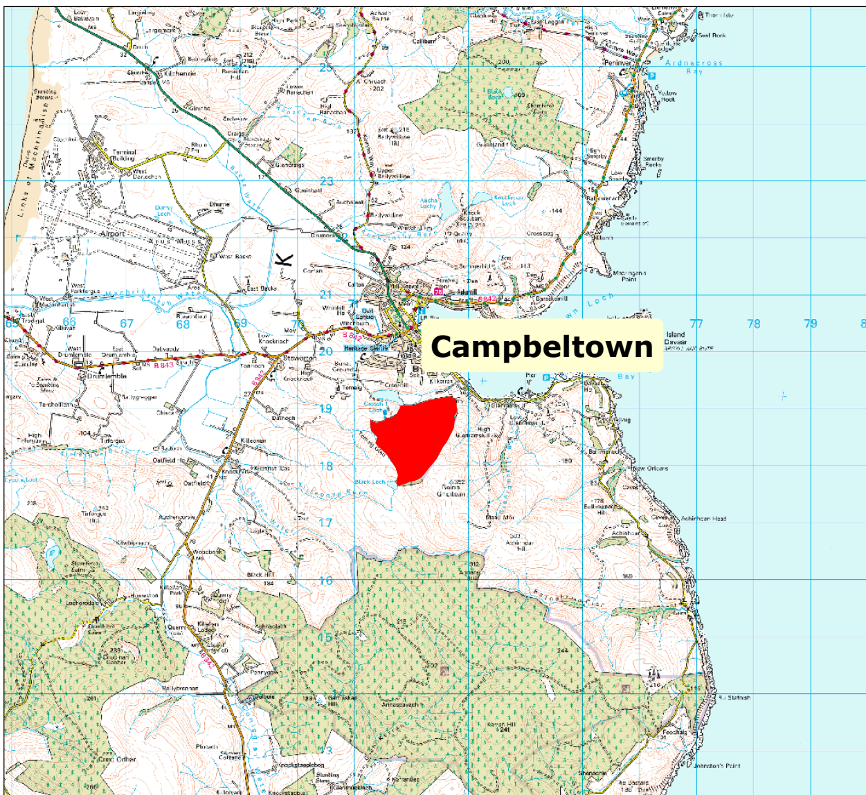
Map 1.1 Location Map