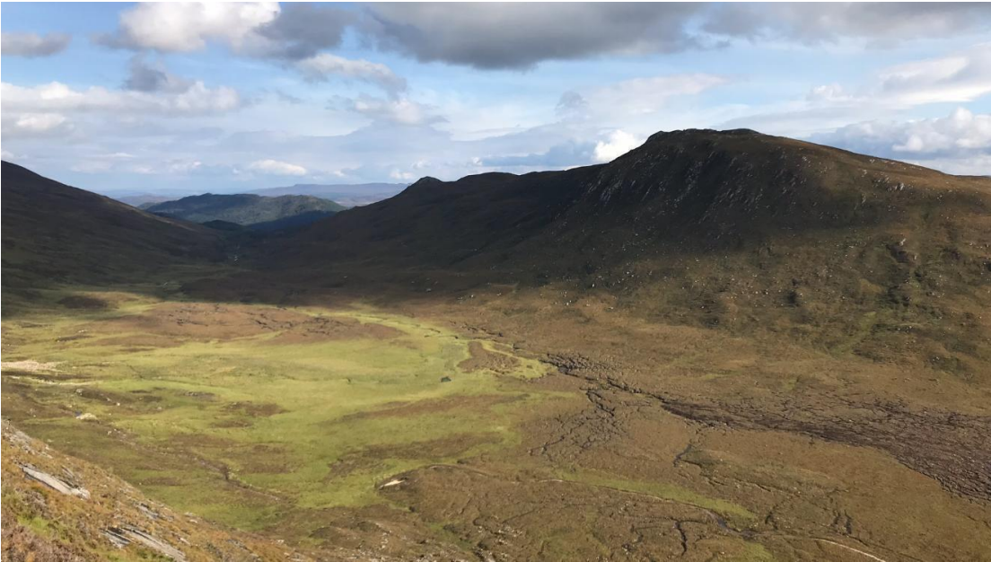
Figure 5. Landscape perspective of Beinn a Mheadhoin before restoration.