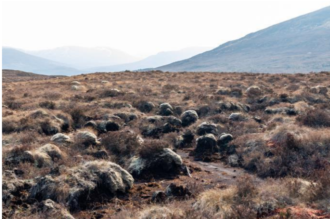
Figure 5a. Extensive peat hags at Glen Affric prior to restoration.

Peat hag and gully re-profiling: this is used to repair excessive erosion of peatlands, usually in an upland setting. Gullies can be caused by excessive surface water run-off or promoted by artificial drains catching water across a natural shedding area, and bringing it to a confluence where erosion begins and continues indefinitely. Hags probably have several triggers, including saturated peats, freezing and unfreezing conditions, over grazing, and perhaps are a legacy of the mini-ice age in the 1700's. Many appear to develop from peat pipes which eventually collapse.