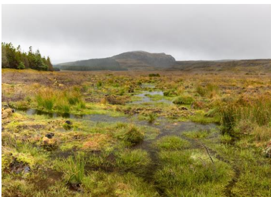
Figure 1a. Peat dams installed at Criadadh More, Isle of Mull on 19/03/2015