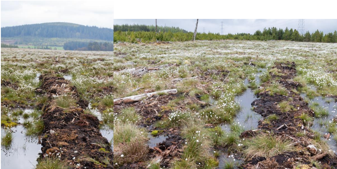
Figure 3. Example of backfill trenches at Gow moss. Note the positive indicators – the high water table and extent of cotton grass.

Peat hag and gully re-profiling: this is used to repair excessive erosion of peatlands, usually in an upland setting. Gullies can be caused by excessive surface water run-off or promoted by artificial drains catching water across a natural shedding area, and bringing it to a confluence where erosion begins and continues indefinitely. Hags probably have several triggers, including saturated peats, freezing and unfreezing conditions, over grazing, and perhaps are a legacy of the mini-ice age in the 1700's. Many appear to develop from peat pipes which eventually collapse.