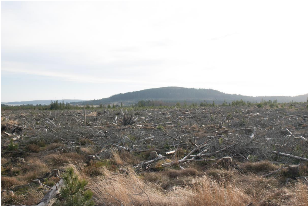
Figure 2. Gow moss after clear felling prior to restoration.