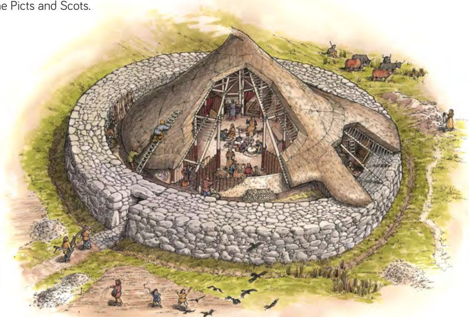
Front Cover: the Queen's View ringfort, overlooking Loch Tummel.