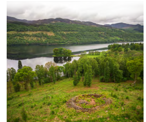
Borenich as it is today, photo by Eddie Martin © Forestry Commission Scotland

Around a mile west of the Queens View, this well preserved ringfort, sits on the edge of Loch Tummel, although the loch level was much lower in the Iron Age (NN 845 600).