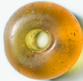
Above: This amber-coloured bead from the Queen's View was one of the few objects not made of stone, wood or leather.