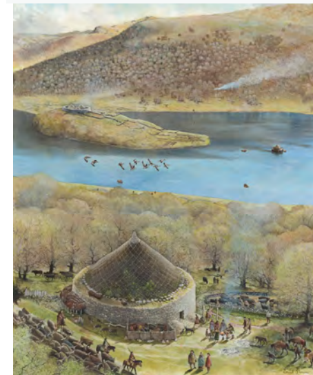
Reconstruction of Borenich by artist David Simon © Perth and Kinross Heritage Trust.

Explore the series of ringforts along the valley floor of this dramatic and remote glen, particularly those built between Pubil and Cashlie (NN 479 416). Remember, "twelve castles had Finn in the dark, bent glen of the stones". The Gaelic names of the ringforts refer to characters in the legends of Finn MacCoul.