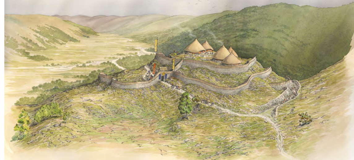
Above: a Pictish seat of power (artist: Chris Mitchell © Forestry Commission Scotland) Below: the site today...