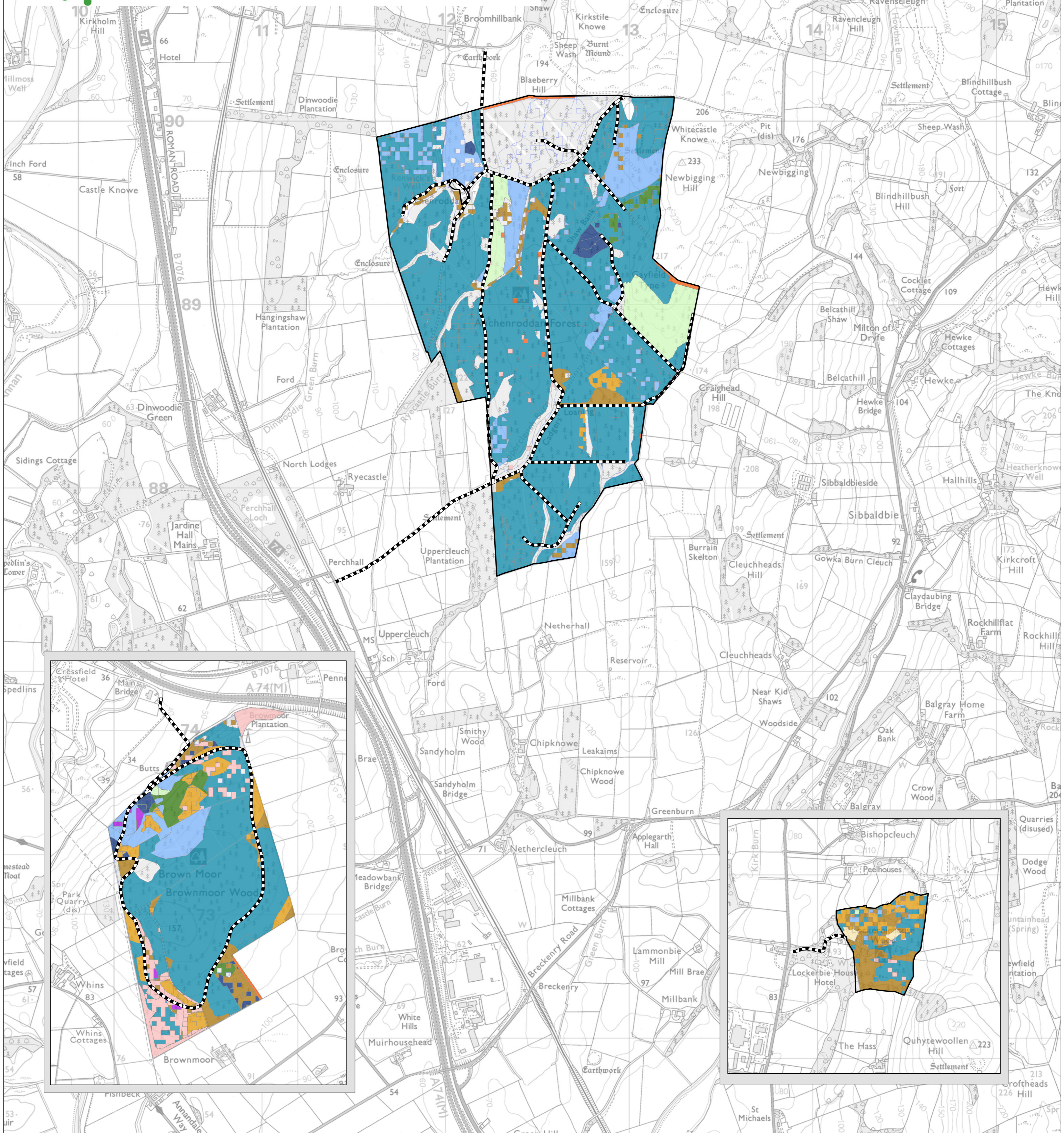
Map 8: Current Woodland Composition