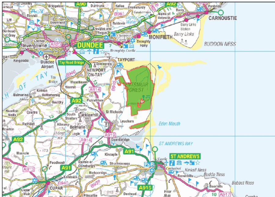
Tentsmuir: location map

Minimising the effects of DNB infection will have a big impact on the current plan. However maintaining a pine forest will remain a priority and influence other aspects of Tentsmuir management.