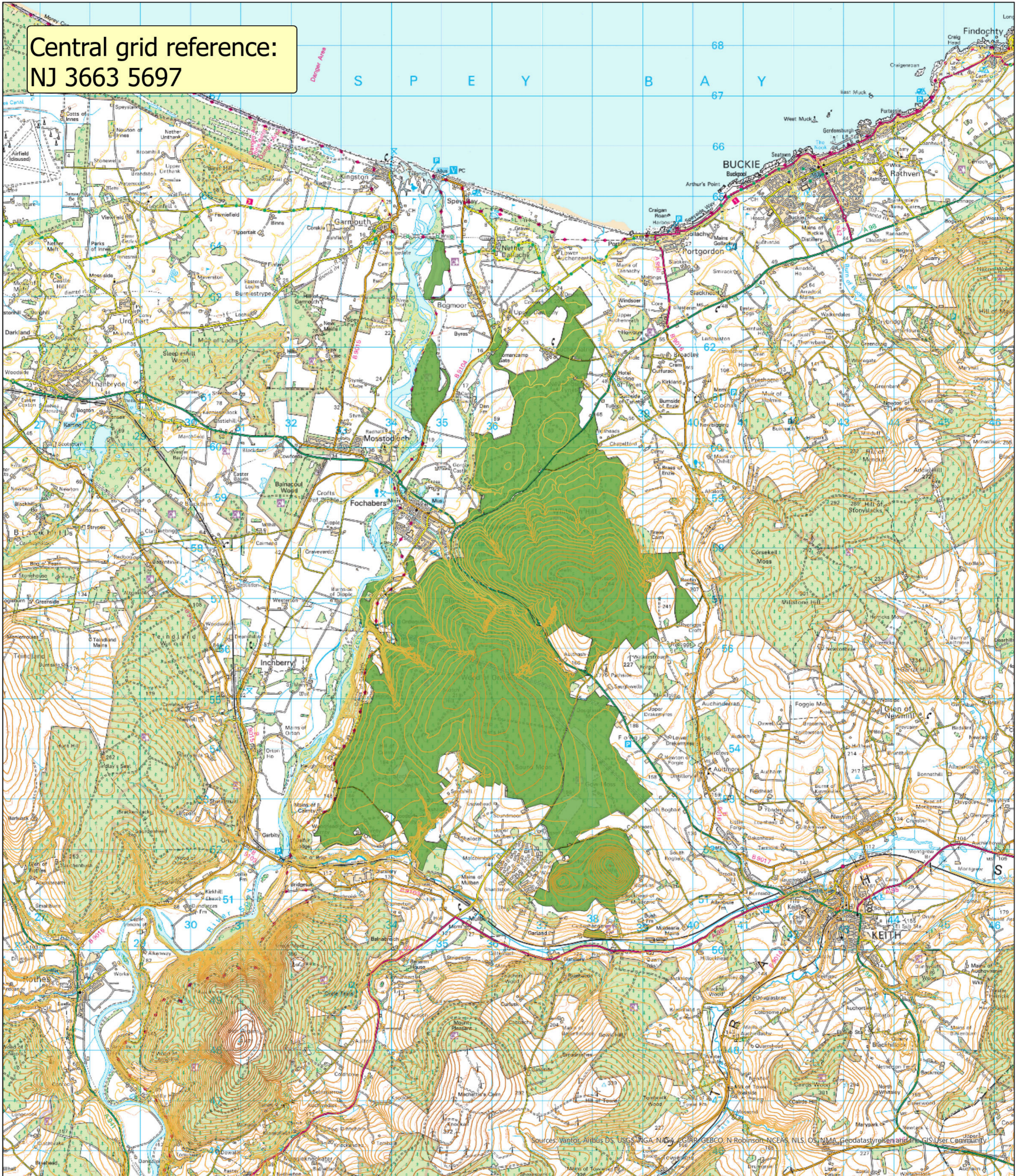
Map 1 - Location